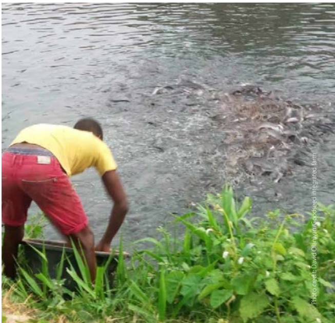
Plate 4. Catfish response to feeding in an earthen pond (top) and feeding catfish in an earthen pond (bottom).

However, the majority of catfish farmers have little or no knowledge on this aspect of their business. Therefore, some fish farmers depend on the judgment/recommendations of their feed millers without questioning the recommendations that result in poor fish growth.