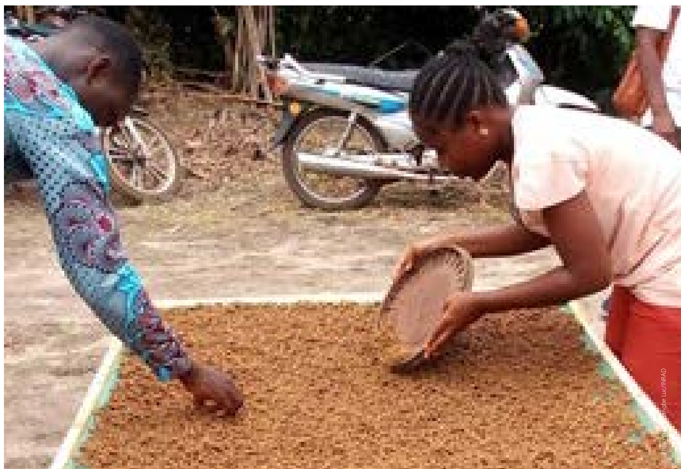
Plate 5. Locally made fish feed being sun dried.

It is necessary to use a system for checking the quality of raw materials before accepting them for producing fish feed. These include (a) conducting a microbiological assessment to identify and quantify any pathogens, (b) checking the nutritional contents to identify and quantify antinutritional factors, and (c) checking for foreign materials, such as metals, rubber or plastics materials, which can endanger the health and life of fish.