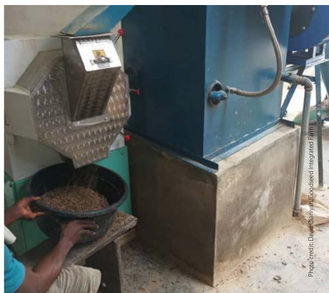
Plate 2. Fish feed pelletizer.