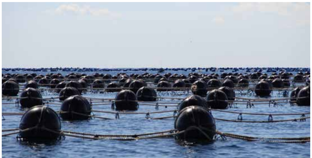
Mussel farm, Primorsko, Bulgaria

Consumer demand and policy developments are also central in shaping the future of aquaculture. For instance, the MSP Directive is expected to improve the sustainability of aquaculture by considering when and where various human activities take place at sea. Member States will be required to carefully plan the co-location of marine activities, such as aquaculture, shipping and offshore energy, with the help of improved spatial data. This should ensure that all activities can benefit from synergies and that any negative environmental impacts can be minimised through their early identification.