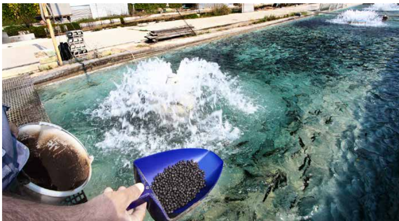
Fish farm at Bussi, in Abruzzo, Italy.

Aquaculture is facing a new era of expansion in Europe. What are the environmental implications of this, and how can the sector expand sustainably? This Future Brief from Science for Environment Policy presents an overview of research into aquaculture's impacts, and considers how it could develop in harmony with environmental goals.